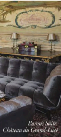
Baron's Suite, Château du Grand-Lucé