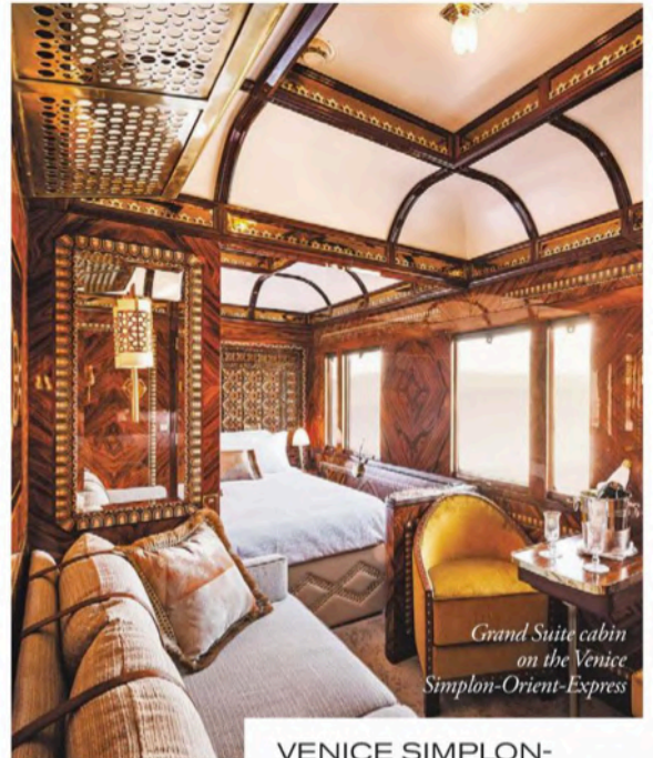
Grand Suite cabin on the Venice Simplon-Orient-Express

restaurant, is fabulous, particularly for Seaside Martinis (made from Cornish sapphire gin) paired with Exmoor caviar; the impromptu drinks party in the Palm Court is always fun; but the black tie dinner in the Grand Ballroom is the ultimate theatrical time warp experience with copper-domed trolleys serving racks of lamb and lemon sole. The hotel is enchanting, offering the most innocent of seaside pleasures, such as swims in the seawater lagoon known as Mermaid Pool, and crab sandwiches at the Pilchard Inn, which dates from 1336. The glamorous island setting could come straight from the pages of Christie's Evil Under the Sun . Double, from £295, including dinner and breakfast (burghisland.com).