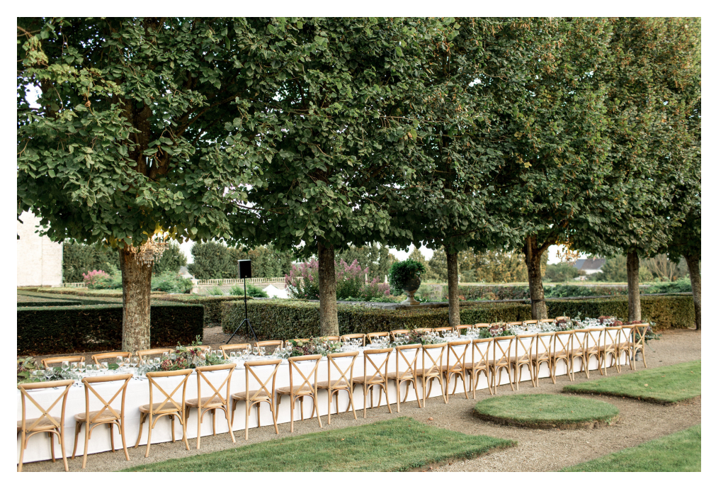
WEDDINGS + EVENTS