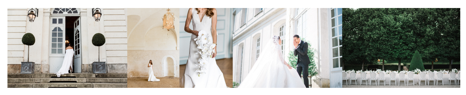
HOTEL CHÂTEAU DU GRAND-LUCÉ

THE EIGHTY ACRES OF LOIRE VALLEY BEAUTY - WITH A LAKE, MEADOWS, HISTORIC WHITE OAK FOREST - SURROUNDED BY A MEDIEVAL WALL ARE TRULY OTHERWORLDLY. THE CHÂTEAU HAS A STUNNING ORANGERIE, WORKING GREENHOUSES, EXOTIC GARDEN WITH A SWIMMING POOL AND STATUES GIVEN AS A GIFT FROM KING LOUIS XV. WITH MULTIPLE COURTYARDS, TERRACES AND SECRET GARDENS - THE OPTIONS FOR AN EVENT ARE LIMITLESS.