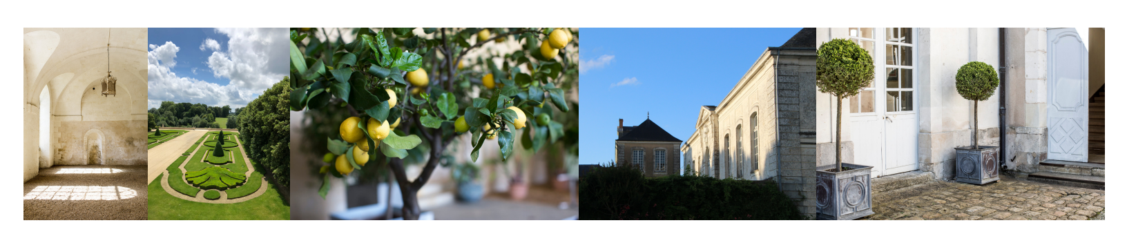
HOTEL CHÂTEAU DU GRAND-LUCÉ

In addition to the main Château, there is a recently restored spa and fitness salon aptly built in the original laundry house, newly restored exquisite ballroom in the former stables and multiple unrestored buildings on site - which are incredible to explore.