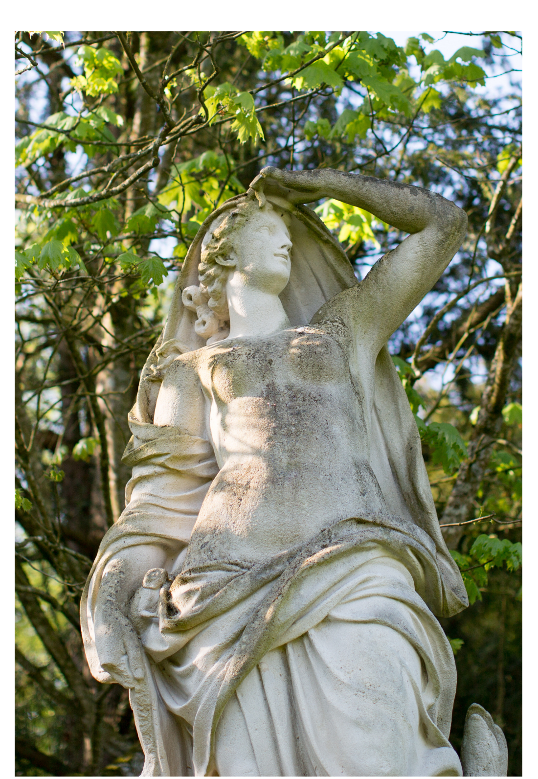
STATUE OF AURA. - GODDESS OF THE WIND. A GIFT FROM KING LOUIS XV 1764.